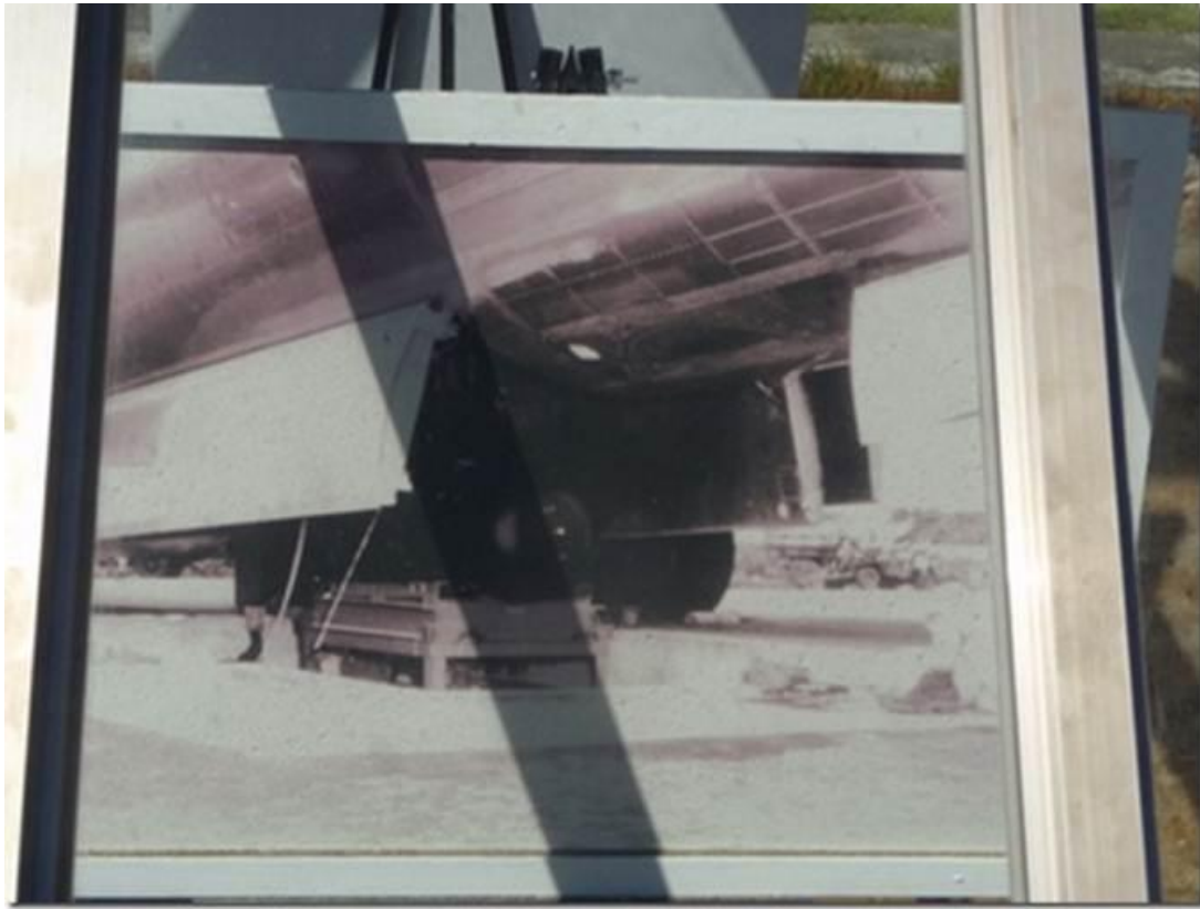
And here on the other side of ramp is "Atomic Bomb Pit #2" where Fat Man was loaded onto Bockscar .