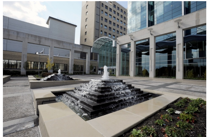
Photos of the Consolidation Building at University Drive campus taken in October 2011