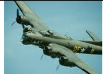
B-17 Flying Fortress

One of the largest aircraft used in WWII, the B-17 was primarily employed in the daylight precision bombing of German targets. It flew in the Pacific as well but on a limited basis against Japanese shipping and airfields.